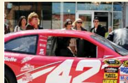
Participants had a chance to experience the NASCAR simulator from Kramer Entertainment