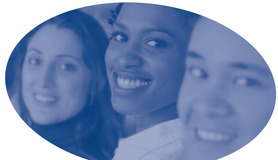
Volunteers needed • Page 4