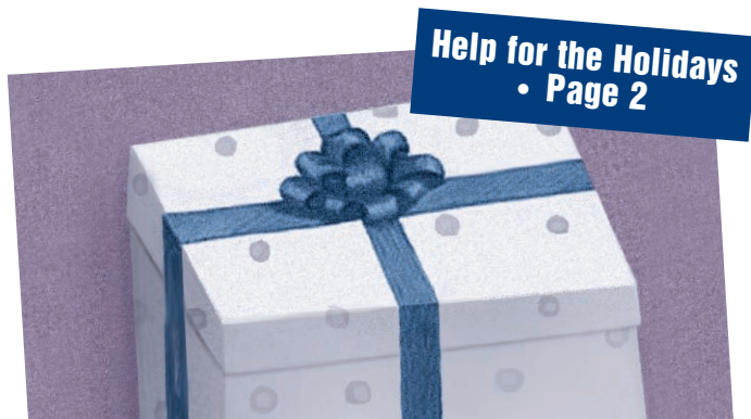
Help for the Holidays • Page 2