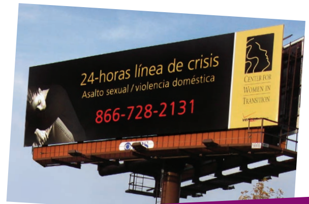
More about our new look • Front Cover