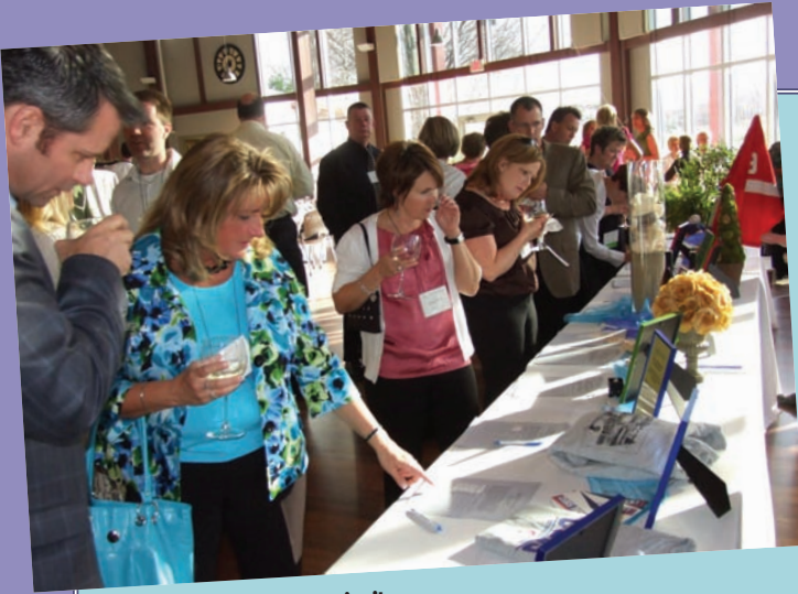
Guests bid on the silent auction items.